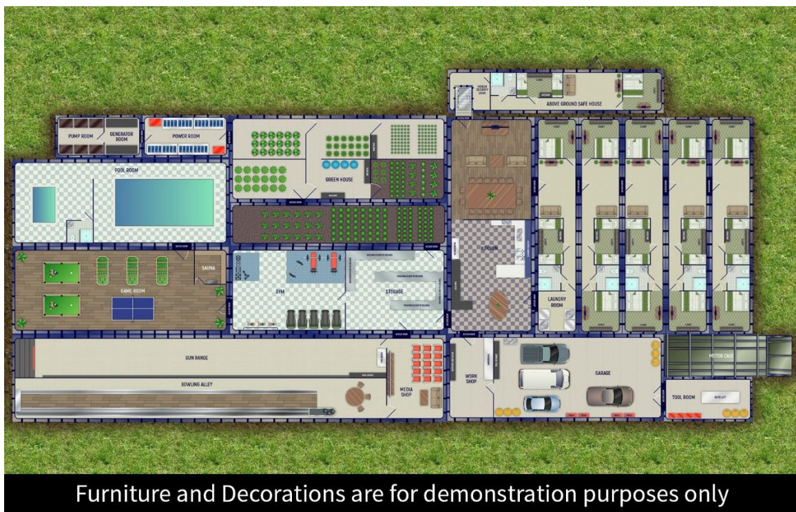
Furniture and Decorations are for demonstration purposes only